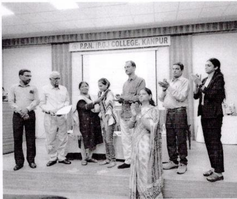
Online Seminar on Suicide in India, World Suicide Prevention Day organized by Dept. of Psychology on 10.09.2021