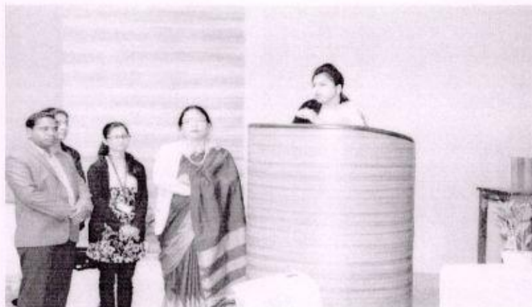
Seminar on Developing Interactive Financial Literacy Tools: An Entrepreneurial Approach 25 th January 2019