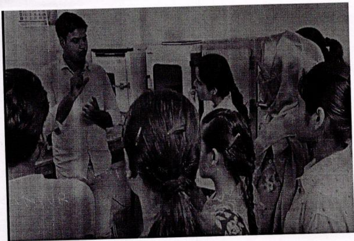
LABORATORY TRAINING IN CHAPERON BIOTECH PVT., LTD, KANPUR