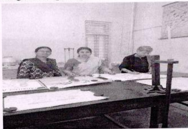
(Mission shakti poster competition on 11 december 2020)

A few significant projects to advance gender equality and individual empowerment were introduced under the Mission Shakti initiative. The Poster Competition, which promoted artistic expression to increase awareness of women's rights, safety, and empowerment, was a noteworthy aspect of this project. In addition to promoting artistic ability, this competition provided a potent platform for spreading important messages among many cultures.