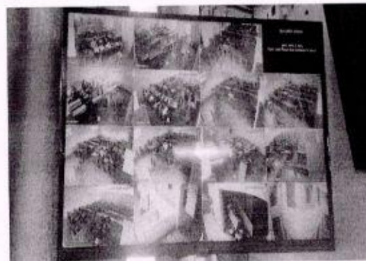
(CCTV Monitor at Principal Office, 20 December 2022)