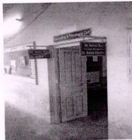
(Counselling & Placement Cell, 20 December 2022)