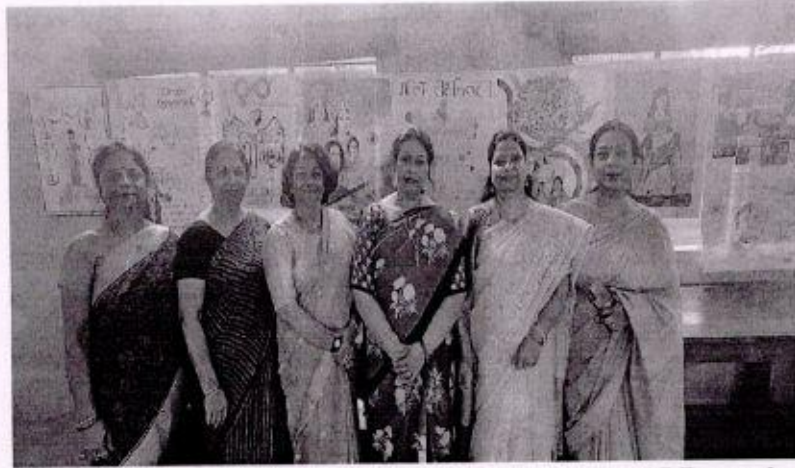
(Poster competition under Mission Shakti Initiative 17 December 2021)

•Telefax: (0512)2361924 • Website: www.ppncollege.org • •email: ppncollegekanpur@gmail.com •