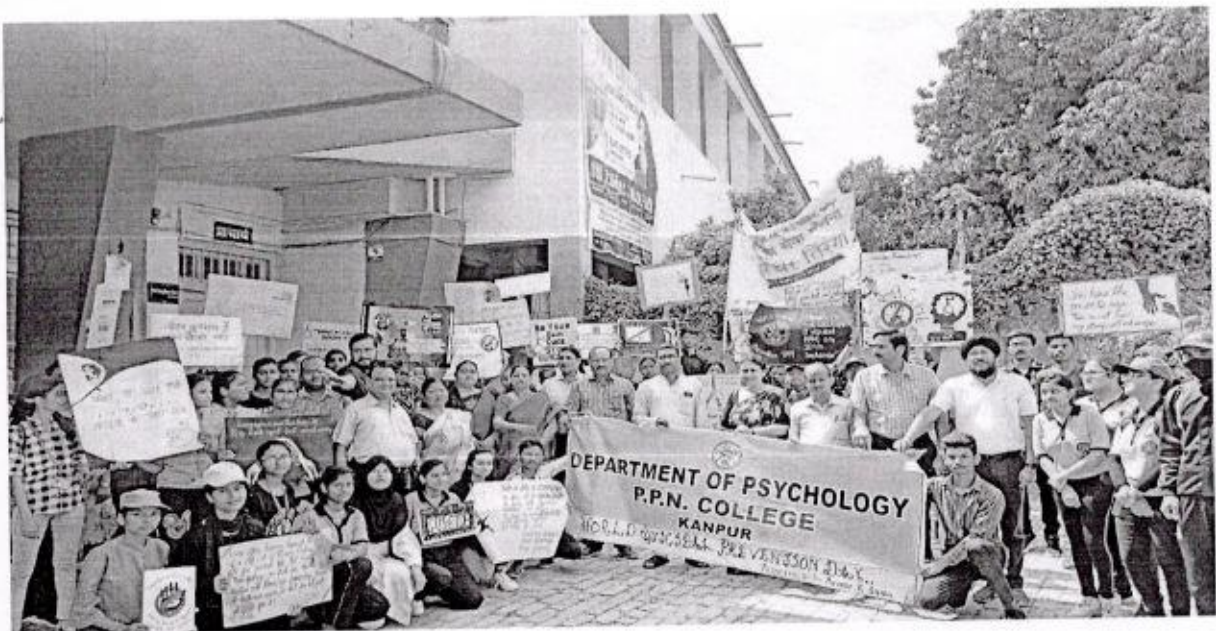
(Suicide prevention Awareness rally)