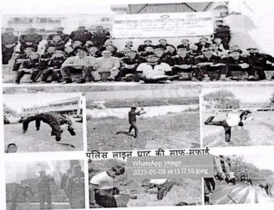
(Cleaning at the bank of River Ganga on 02-04-2023)

WhatsApp Image 2023-04-02 at 16.38.55 (1).jpeg