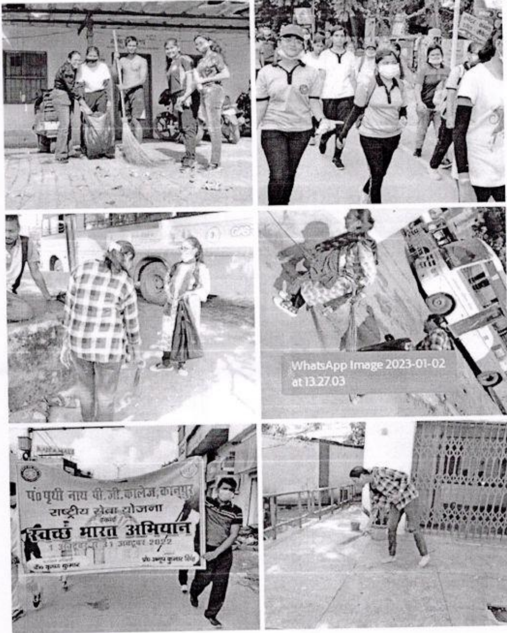
(Cleaning at Bus Stand on 31 October 2022)